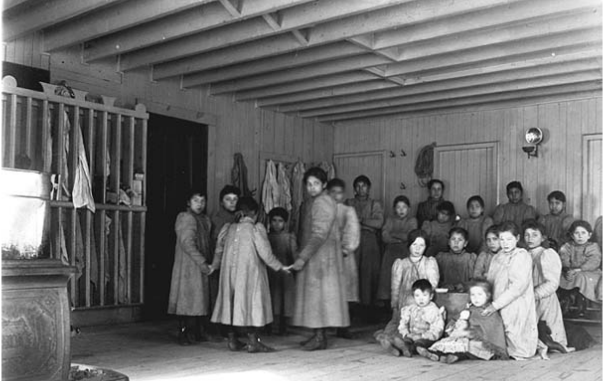
More Photos from Indian Boarding Schools (locations unknown)